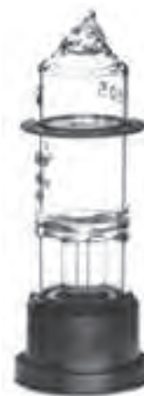
Small Outline Lamp for Varian® HP®, OI®, SRI® and Tremetrics® (Tracor®). CPI P/N 4080-02