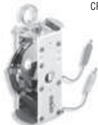
Multiplier for API® III LC/MS. Includes Sciex® Leads. CPI P/N 4200-010219