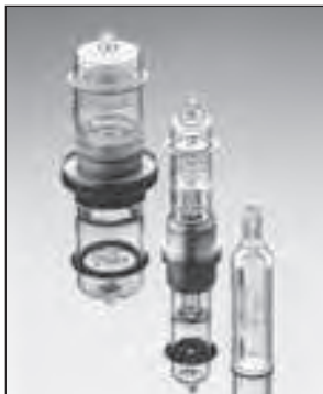
CPI offers a complete selection of PID lamps to meet your needs.

Save up to 35% on PID lamps with a CPI Annual Savings Contract. Standing Order Programs are also available for efficiency and additional cost savings.