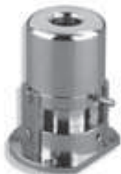
Mount Assembly, including multiplier for Polaris Q, GCQ, LCQ DECA/DUO, Trace MSQ, LTQ. CPI P/N 4200-010241