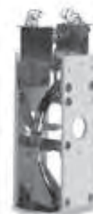
Multiplier for Varian® Auger Analyzer. CPI P/N 4200-010247