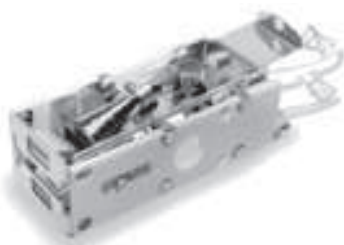
Multiplier for PPINICI 4000, 4500, 4600. All PPINICI Multipliers include the conversion dynodes. CPI P/N 4200-010208

Pictured below are popular multipliers for Thermo-Finnigan® instrumentation: