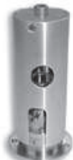
Mount Assembly, including multiplier for Trace DSQ. CPI P/N 4200-010245