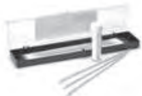
PID lamp cleaning kit. CPI P/N 4080-20