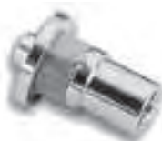
Replacement Element for Trace DSQ. CPI P/N 4200-010244