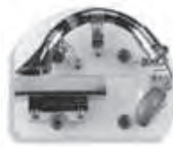
Multiplier for API® 4000/3000 & 100, 200, 300 Series. CPI P/N 4200-010218