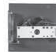
Waters LC/MS Integrity Multiplier. CPI P/N 4200-010217