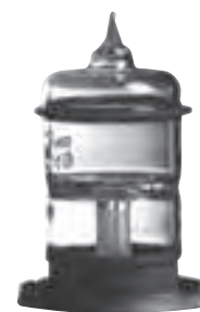
Large outline 10.2 eV PID lamp, for PE®, SRI®, hnu®. CPI P/N 4080-12

Our OEM manufacturer of CPI PID lamp P/N 4080-02 has improved the optic path, lens seal and base shape to provide better linearity and lifetime! You will automatically receive this improved product on your next order of CPI P/N 4080-02!