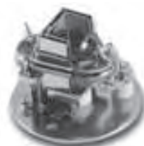
Inficon XPRII Multiplier. CPI P/N 4200-010251