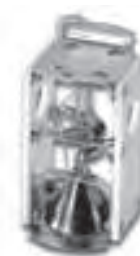
CIMS 500 Multiplier. CPI P/N 4200-010230

It is ideal to store the multiplier in vacuum, but not required. These lead glass multipliers are air stable devices that can be stored indefinitely, as long as the units are kept out of direct sunlight, dry and kept in their original sealed bags prior to use. CPI fully warranties all multipliers for shelf life.