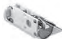
Balzers Prizma Multiplier. CPI P/N 4200-010250