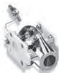
Multiplier for PE® Ion Trap. CPI P/N 4200-010204