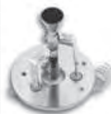
MAP215-50 Multiplier. CPI P/N 4200-010252