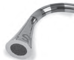
Replacement Glass Element, Unmounted for TSQ70 (20 kv dynode), TSQ700, ITD700/800, ITS40, Magnum, SSQ, TSQ7000 and TSQ Quantum. CPI P/N 4200-010206