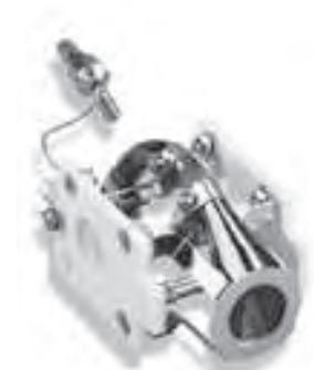
Multiplier for Varian® Saturn I, II, & III, Mounted. CPI P/N 4200-010204