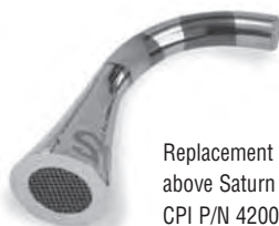
Replacement Element for above Saturn I & II Multiplier. CPI P/N 4200-010206