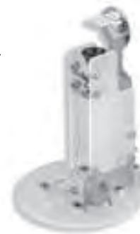
Multiplier for API® 2000. CPI P/N 4200-010243