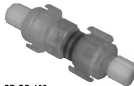
CT-QD-102 Quick Disconnect for 1/8" OD tubing