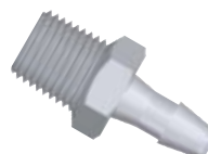
CT-X-243 1/8" NPT to 5/32" Barb