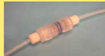
QD-102 attached to 1/8" OD tubing

Use the QD-102 quick disconnect for an inline 1/8" OD tubing connection that prevents fluid leaks when disengaged. Turn the mating components to detach with luer-like efficiency. Polypropylene with Viton seals.