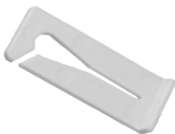
CT-X-095 Tube Clamp with Split, 1/8" (3.2mm) OD Tubing