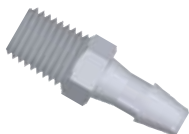
CT-X-243 1/16" NPT to 5/32" Barb