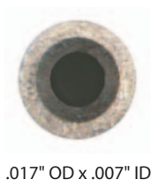
.017" OD x .007" ID

We take polyimide-coated fused silica (FS) and remove the polyimide layer. Then we electrochemically plate the FS with pure nickel. The resulting nickel-plated FS tube provides superior heat transfer to the FS lining, permitting use as a flexible transfer line with the best qualities of silica-lined stainless but with improved heat transfer and a shorter bend radius. The 1/32" OD tubing is available in IDs from .002" to .010". For high pressure applications, we recommend using our 1/32" 316SS ferrules.