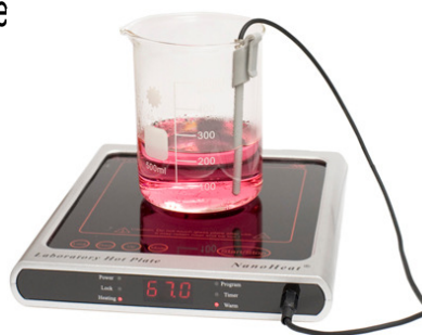
LQ2111 AME NanoHeat® Hot Plate With Temperature Feedback Probe