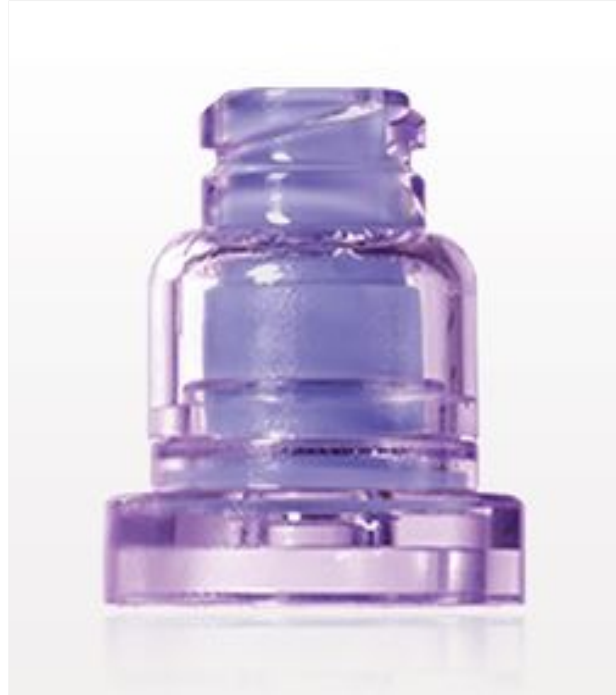
90406 Needleless Injection Site, Swabbable Female Luer...