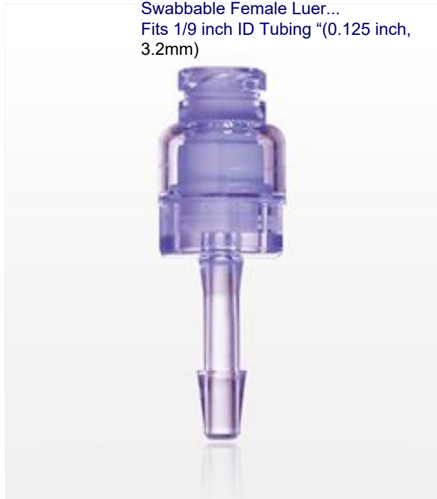
80210 Needleless Injection Site, Swabbable Female Luer... Fits 1/9 inch ID Tubing (0.125 inch, 3.2mm)