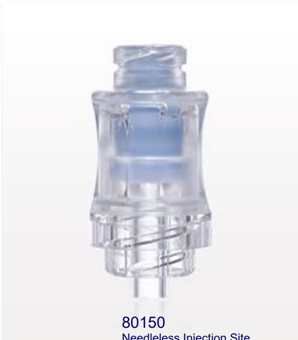
80150 Needleless Injection Site, Swabbable Female Luer...