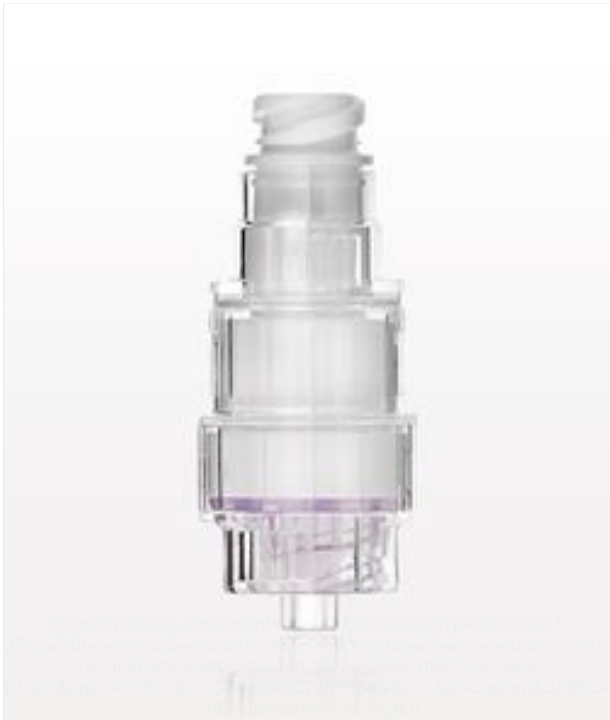
91600 Needleless Injection Site, Swabbable Female Luer...