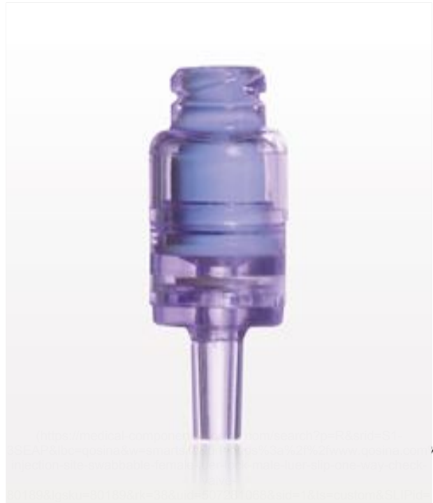
80189 Needleless Injection Site, Swabbable Female Luer...