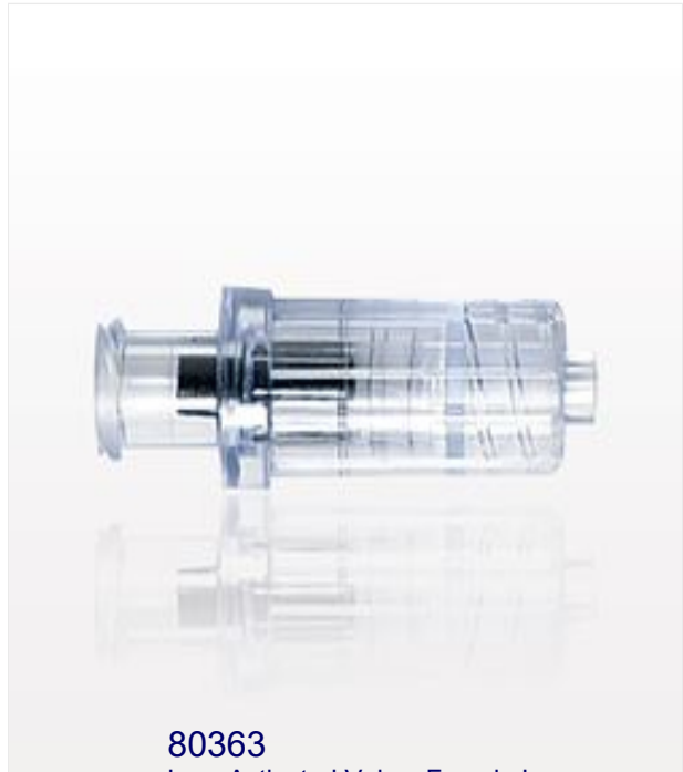
80363 Luer Activated Valve, Female Luer Lock, Male Luer