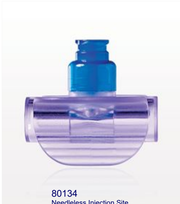
80134 Needleless Injection Site, Swabbable Female Luer... both ports fit 0.268 inch OD Tubing (6.8 mm)