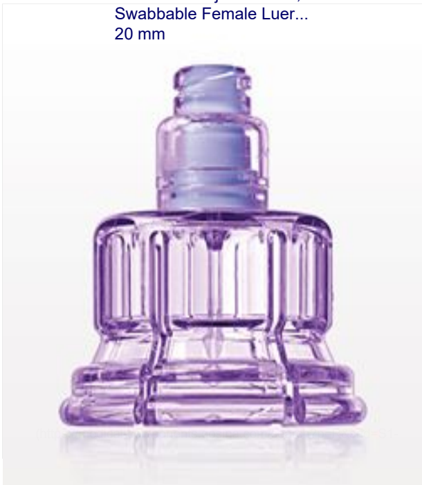
80221 Needleless Injection Site, Swabbable Female Luer... 20 mm