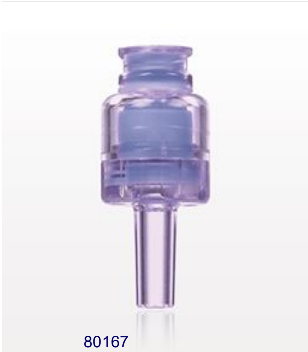
80167 Needleless Injection Site, Swabbable Female Luer...