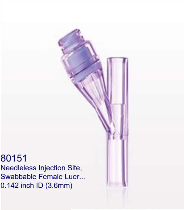
80151 Needleless Injection Site, Swabbable Female Luer... 0.142 inch ID (3.6mm)