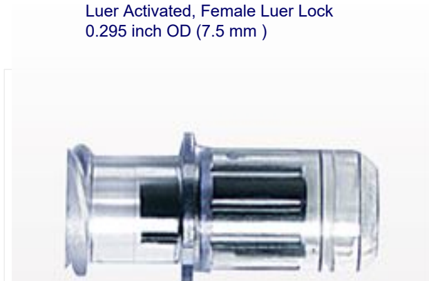
80362 Luer Activated, Female Luer Lock 0.295 inch OD (7.5 mm )