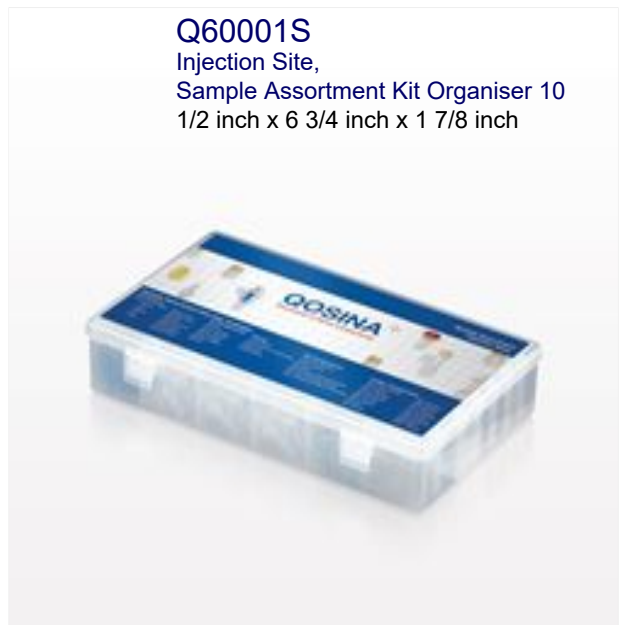
Q60001S Injection Site, Sample Assortment Kit Organiser 10 1/2 inch x 6 3/4 inch x 1 7/8 inch