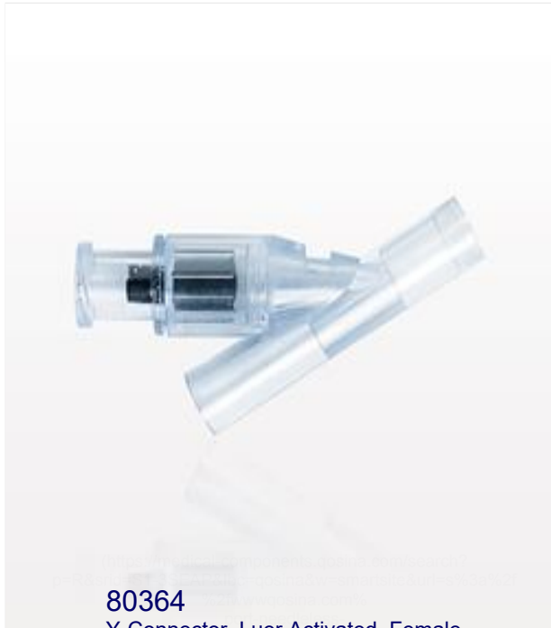
80364 Y-Connector, Luer Activated, Female Luer Lock 0.156 inch ID x 0.25 inch OD (3.9 mm x 6.4 mm)