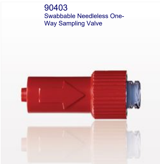
90403 Swabbable Needleless One- Way Sampling Valve