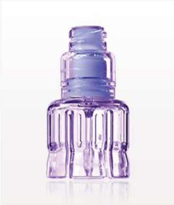
80220 Needleless Injection Site, Swabbable Female Luer... 13 mm