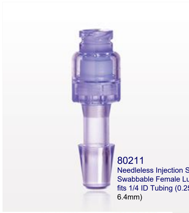
80211 Needleless Injection Site, Swabbable Female Luer... fits 1/4 ID Tubing (0.25 inch 6.4mm)