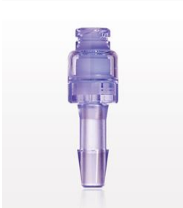
80209 Needleless Injection Site, Swabbable Female Luer...