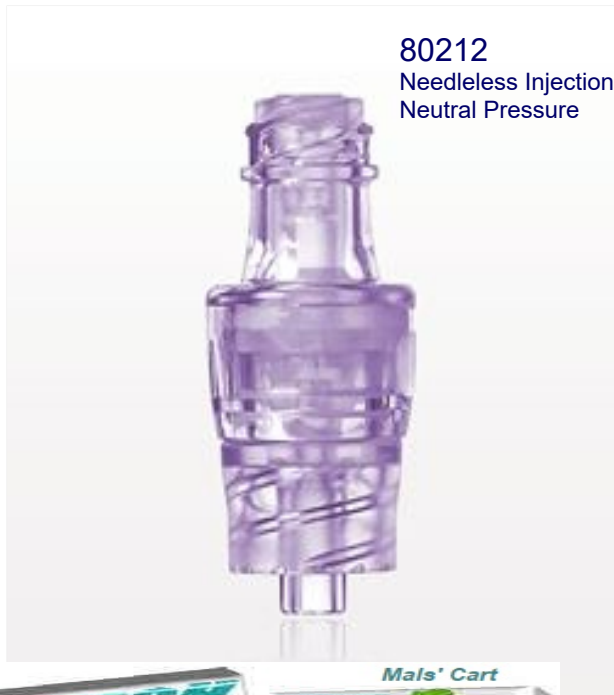
80212 Needleless Injection Site, Neutral Pressure