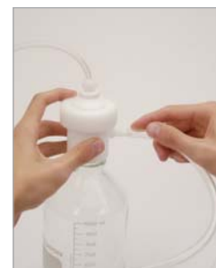
Connect vacuum line to side port.