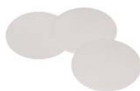
Polypropylene Membrane Filters