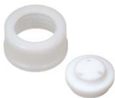
Hub-Cap (assembly of the bottle cap and plug)