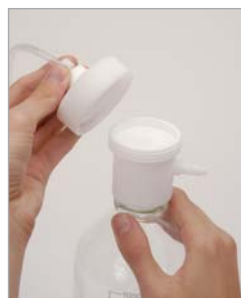
Unscrew and lift off top.