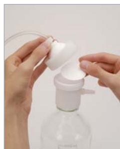
Place membrane filter on top of grid.