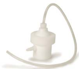
Hub-Cap Filter Kit