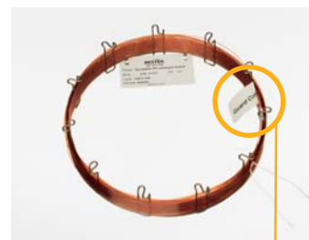
Tag indicates guard column end.

Integra-Guard® columns are available for all phases listed, for columns with 0.25, 0.32 or 0.53mm ID. If you don't see what you need here, contact us.