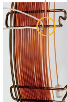
String indicates where the analytical column begins.