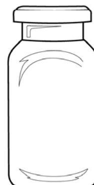
10 mL Clear Rounded Bottom