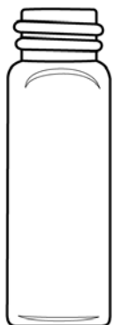
4.0 mL Screw-Thread Step Vial