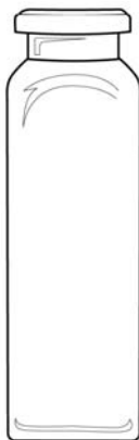
4.0 mL Clear Crimp-Top