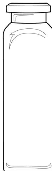
20 mL Clear Flat Bottom