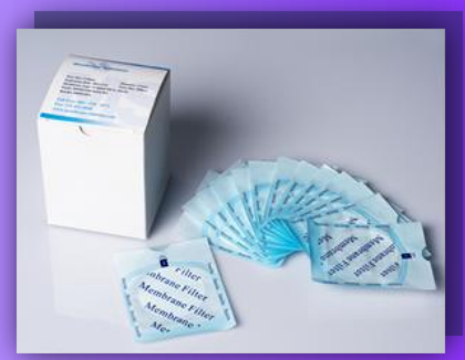
MCE Gridded Membrane