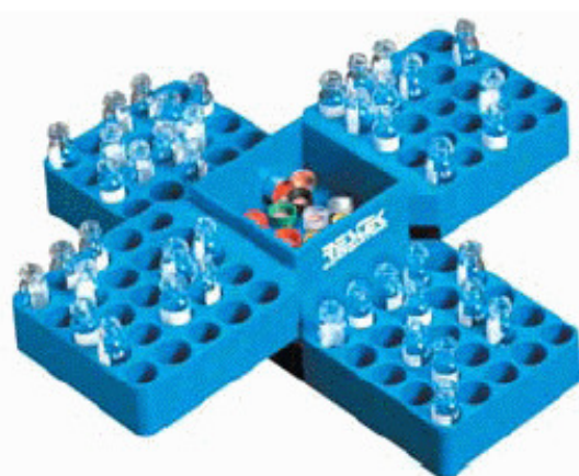
2.0 mL Sample Vial Racks