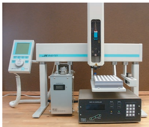
Fast GC Module and controller mounted on an autosampler