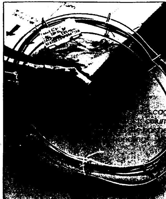
Restek's cage design allows the tubing to be processed before installing it in the cage, so the tubing strength can be constantly monitored.