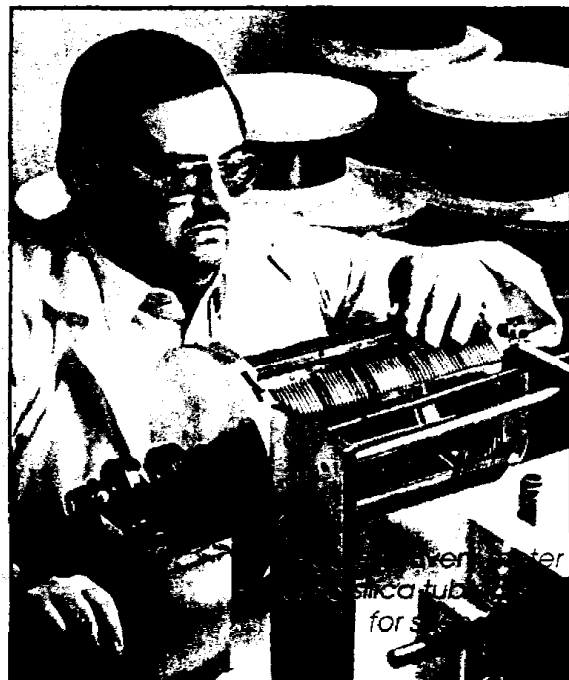
Restek uses a manual winding system that assures every meter of every column is checked.

Our inventory and production control group is constantly refining production schedules to meet demands. Our goal is to have products in stock and ready to ship when needed. In fact, over 98% of our products are shipped the same day. If products are not in stock, our production chemists work overtime to get them done as quickly as possible.