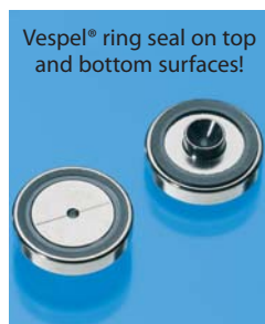
Vespel® ring seal on top and bottom surfaces!

In Agilent split/splitless injection ports, it can be difficult to make and maintain a good seal with a conventional metal inlet disk. The metal-to-metal seal dictates that you apply considerable torque to the reducing nut, and, based on our testing, this does not ensure a leak-tight seal. Over the course of oven temperature cycling, metal seals are prone to leaks, which ultimately can degrade the capillary column and cause other analytical difficulties.