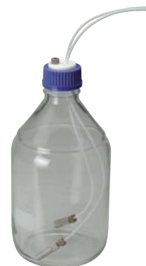
Opti-Cap™ Kit with bottle