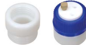
cat. # 26538