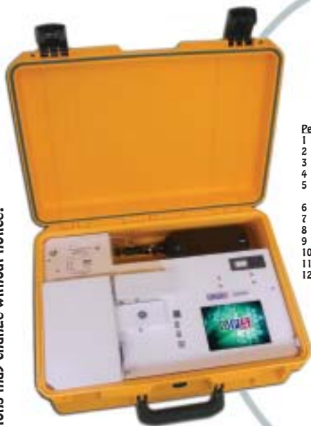
Companion 1 Portable GC