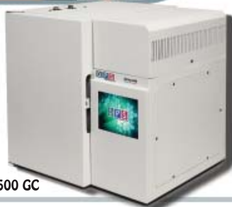
Series 600 GC