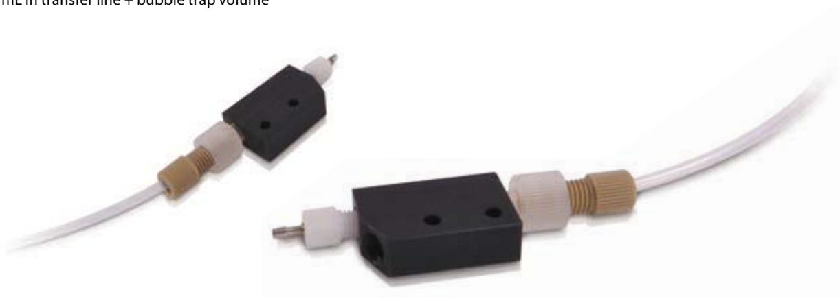
Effect of Degassing on Dispense Accuracy