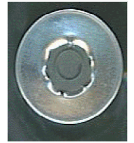
Flip off cap with thumb