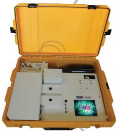
Companion 2 Portable GC