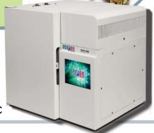
Series 600 GC