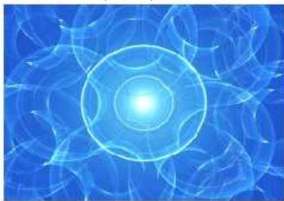
Core Shell Particle