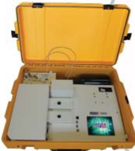
Companion 2 Portable GC

PID Detector Detector Temperature = 250C Gain = 6 Collector = -100V Carrier = Helium @ 160 kPa Column = 30m x 0.53 MXT-WAX Temp Program = 100C (hold 2 Min) to 240C @ 10C/min