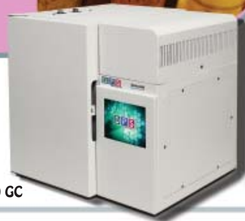
Series 600 GC