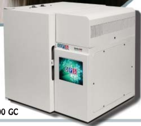
Series 600 GC