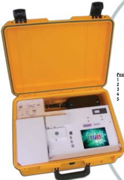
Companion 1 Portable GC