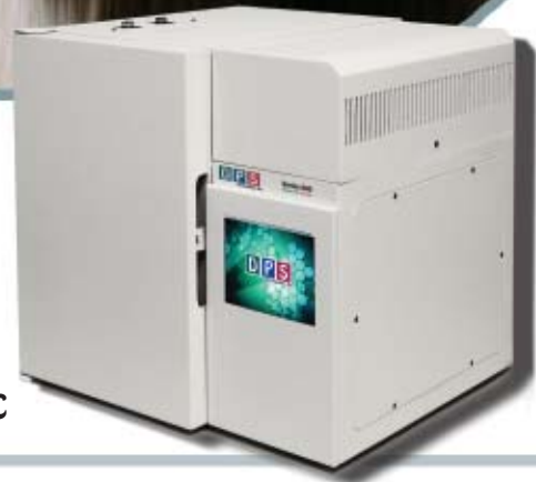
Series 600 GC