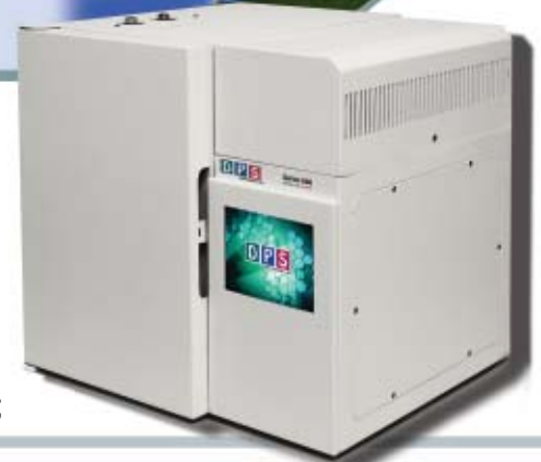
Series 600 GC