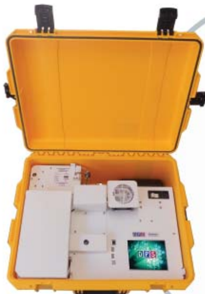
Companion 2 Portable GC (with Air Concentrator)