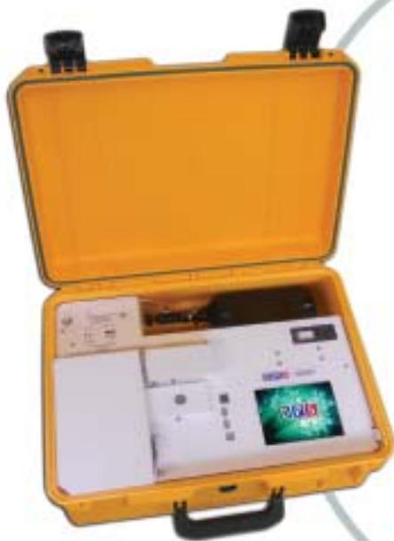
Companion 1 Portable GC