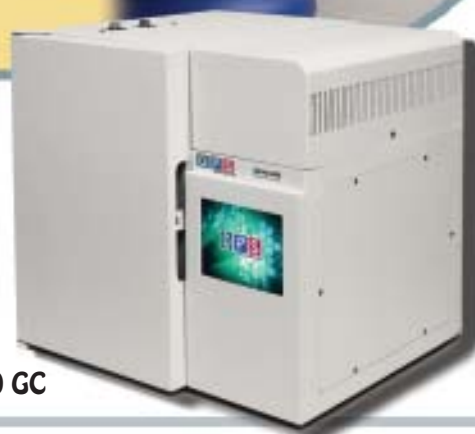
Series 600 GC