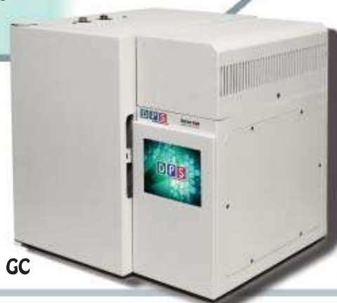
Series 600 GC