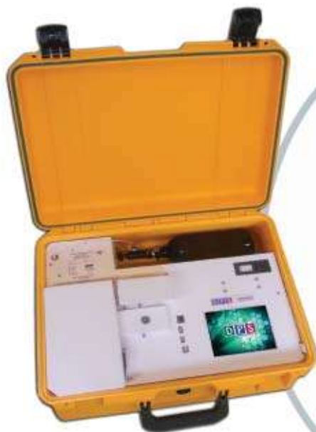
Companion 1 Portable GC