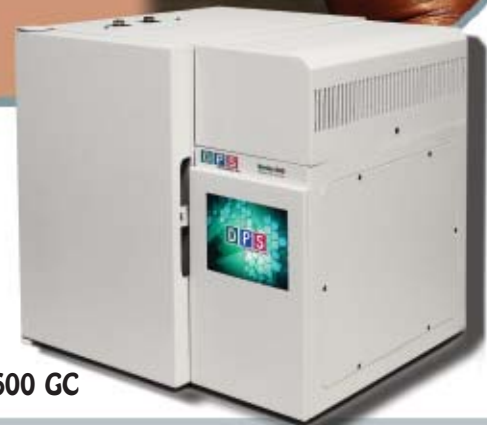
Series 600 GC