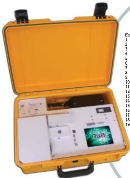
Companion 1 Portable GC