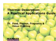
Food, Flavor, Fragrance & Odor Profiling FFTG1037