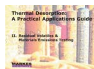
Residual Volatiles & Materials Emissions Testing GNTG1035