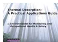
Environmental Air Monitoring and Occupational Health & Safety EVTG1034

Thermal desorption application guides are available for a broad range of markets. Request your FREE copy today using these part numbers.