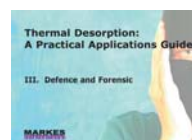
Defense & Forensic CFTG1036