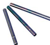
Stainless Steel, Unconditioned