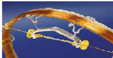
Vu2 Union® Connector