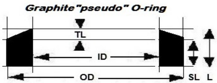
SFOD/ID/L-SL-TLG (in mm) 1. SF30.0/25.4/6.0-4.2-1.8G