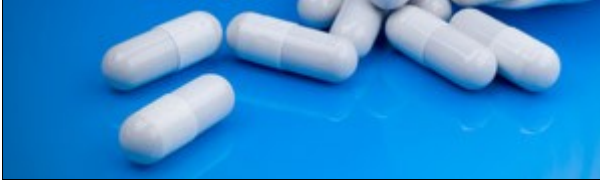
PHARMACEUTICAL AND MEDICINE