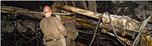
HEALTH AND SAFETY