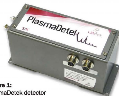
Figure 1: PlasmaDetek detector

This is a stand-alone detector system that requires only helium carrier gas to make the measurement. No need of doping gas or other devices to make it selective to argon against oxygen.