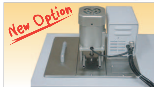
Optional With External Circulation Pump