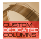
View Full-Size Image