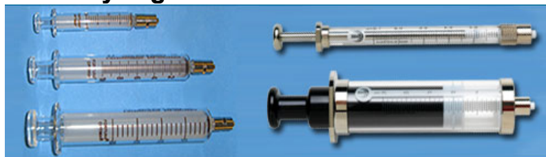
Standard Glass Syringes