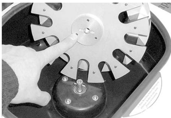
The slot in the bottom of the rotor must be aligned with the pin in the motor shaft!