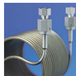
Welded VCR Fittings