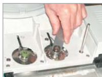
Use the smaller end to remove the septum nut.