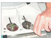
Use the larger end to tighten the split/splitless weldment nut.