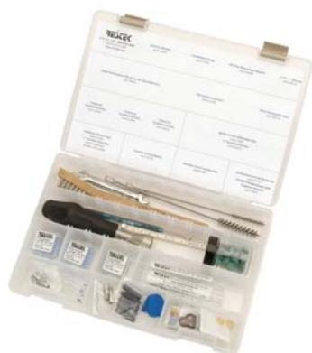
Inlet Maintenance Kit for Agilent 5890/6850/ 6890/7890 GCs