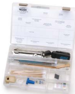
For PerkinElmer GCs (cat.# 22185)