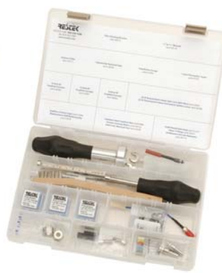
FID Kit for Agilent 5890 GCs