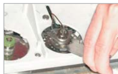
Use the larger end to tighten the split/splitless weldment nut.