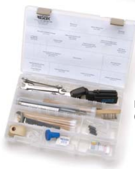
For Shimadzu GCs (cat.# 22182)