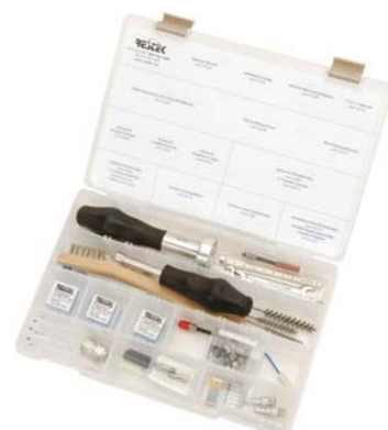
FID Kit for Agilent 6850/6890/7890 GCs