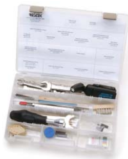
For Agilent GCs (cat.# 22186)