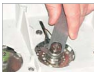
Use the smaller end to remove the septum nut.