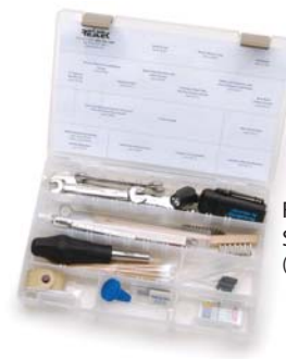
For Thermo Scientific GCs (cat.# 22183)