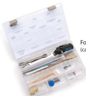
For Varian GCs (cat.# 22184)