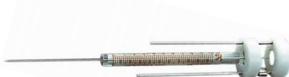
Hamilton Syringe Guide

**Fits Rheodyne® & Valco® injection valves