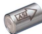
Inlet and Outlet Check Valves for Waters Instruments