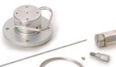
717 Seal Pack (Rebuilt) with Needle