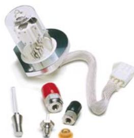
Inlet Check Valve (cat.#26521)