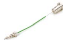
Needle Seat Assembly