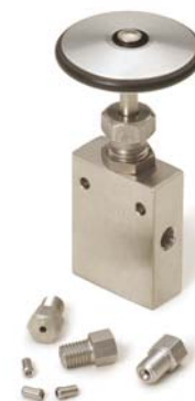
Side Vent Valve