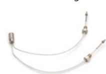
Mixing Capillary Assembly