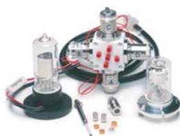
Preventative Maintenance Kit for 717 Autosampler

*Ultra-high molecular weight polyethylene (UHMWPE).