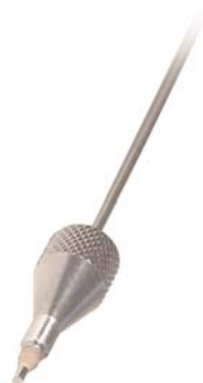
Stainless Steel Secure-Fit Fitting

A good connection between HPLC components is necessary for trouble-free chromatography. Secure-Fit connectors from Restek and Selerity Technologies ensure a consistent, leak-free seal—and they eliminate excess dead volume! An internal spring mechanism holds the capillary tubing at the proper depth in the female fitting. This seal is maintained while you finger-tighten the nut. These fittings are available in stainless steel or PEEK™, and in a variety of tubing lengths and internal diameters.