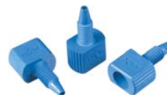
PEEK™ Fingertight Fittings