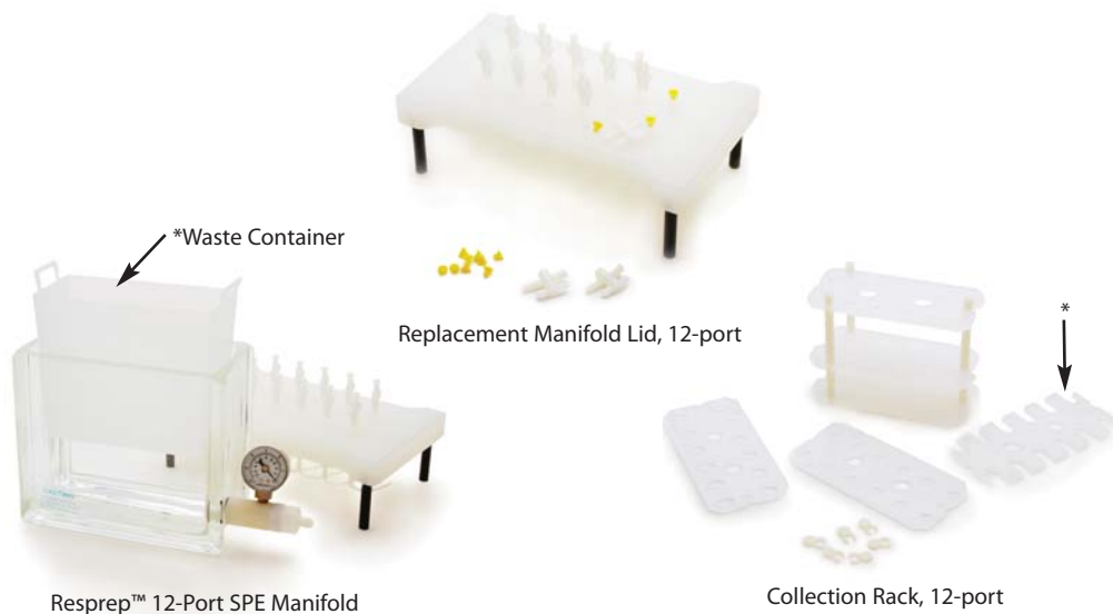
Resprep™ 12-Port SPE Manifold