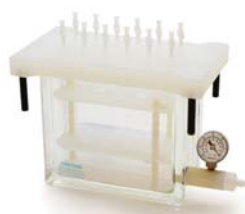
Resprep™ 12-Port SPE Manifold