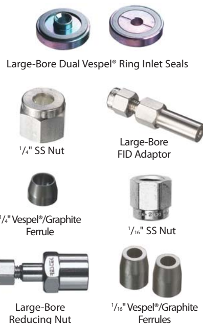
Large-Bore Dual Vespel® Ring Inlet Seals