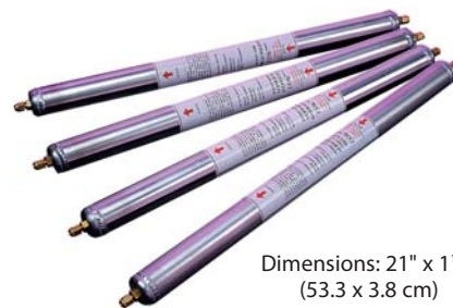
Dimensions: 21" x 1 1/2" (53.3 x 3.8 cm)

Performance for these purifiers is optimized by incorporating a multiple-bed format that progressively lowers concentrations of contaminants at each successive bed. VICI® Mat/Sen® purifiers are guaranteed to produce gases that are purer than 99.9999%, when supplied with gas of 99.995% purity, and are prepurged with the specified gas to speed conditioning. Purifier capacity is approximately four tanks of gas at 99.995% (50 ppm) purity, and correspondingly longer for purer gases.