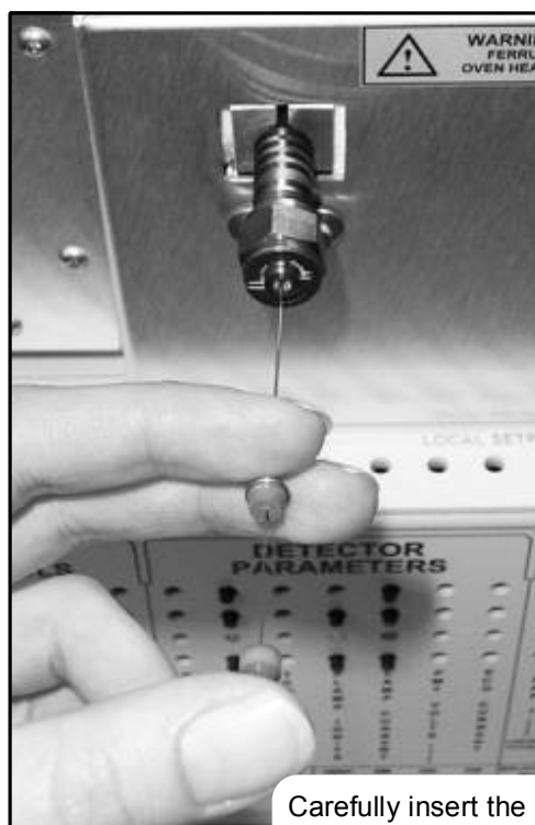
Carefully insert the SPME syringe into the hot injector port and push the plunger

3. Condition the SPME fiber between runs by leaving it in the hot injector port long enough to remove any analytes.