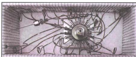
22-port stream selector valve on our 10 position Method 5030 Purge & Trap Autosampler

SRI uses 10-port gas sampling valves because they provide more analytical flexibility for the same cost as 4 or 6 port valves. 10-port gas sampling valves can easily be plumbed to replicate the function of the simpler valves, while offering many other possible configurations. SRI offers standard plumbing configurations, including: Inject Only , Inject and Backflush , Pre-column Backflush to Vent , Column Sequence Reversal , Alternate Loop Inject , and Dual Loop-Dual Column . Many more plumbing configurations are possible, especially when multiple valves are plumbed together.