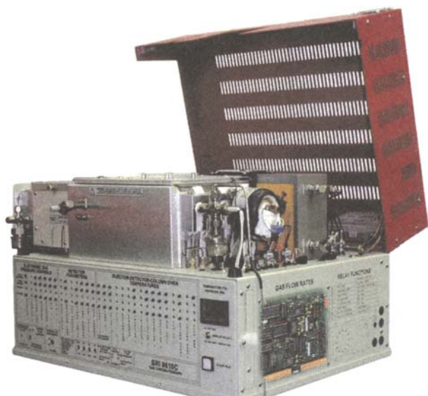
4 channel data system built into an 8610C GC