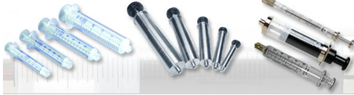
Disposable Plastic Syringes Plumbing Supplies