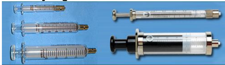
Standard Glass Syringes